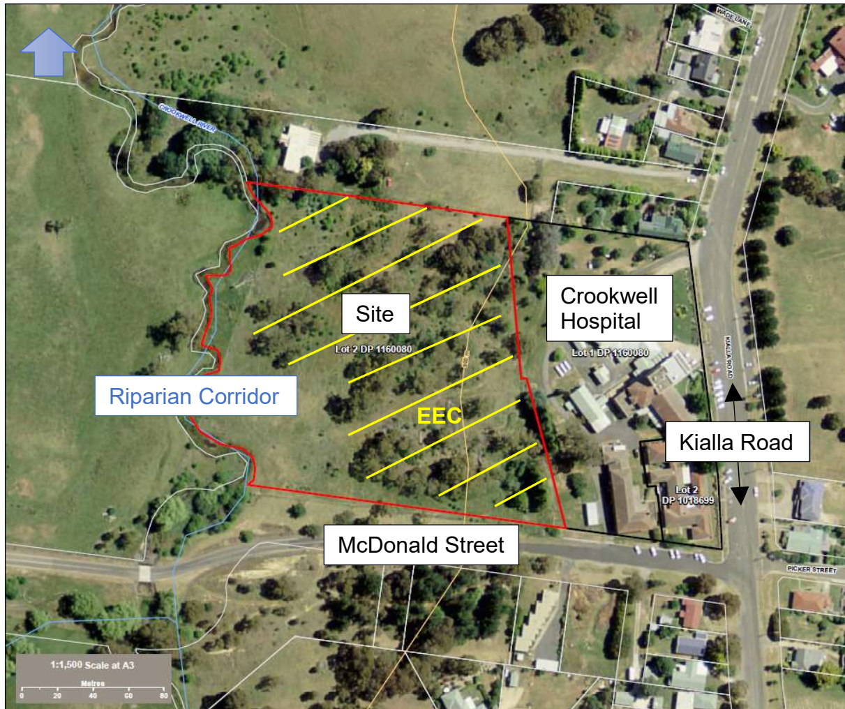
Figure 1 – Site map